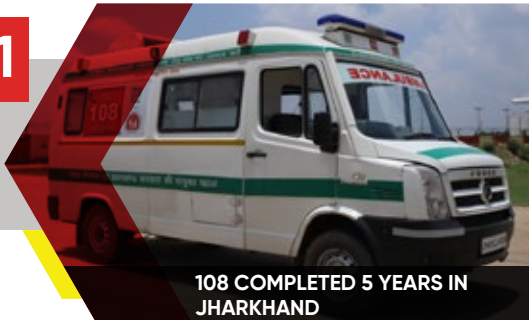
108 COMPLETED 5 YEARS IN JHARKHAND

We are indeed delighted to have completed 5 successful years of operating the Dial 108 Ambulance Service in Jharkhand. The journey has been a rewarding and enriching one. We would like to pay special gratitude to the National Health Mission (NHM) for always guiding us and helping us in render our services to the best of our ability. We are currently operating 339 Ambulances in the state and have served over 9 Lakh lives, of which 3.8 Lakh have been pregnant women.